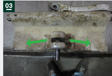
03: Remove bolt cover