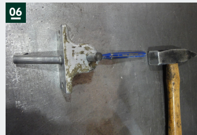
06: Dismantle and replace the separation pin

Afterwards the assembly is carried out in reverse order.