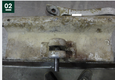
02: Remove lever