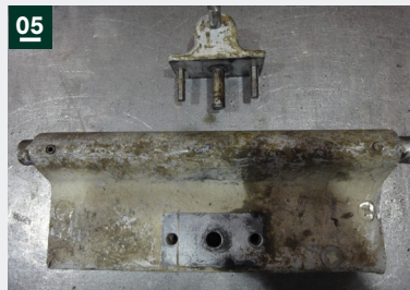
05: Remove the bearing block