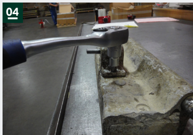
04: Loosen and remove the bolts